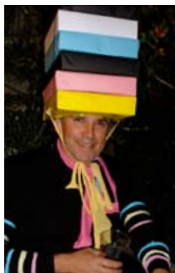
Chris Webb Photography (don't ask..)